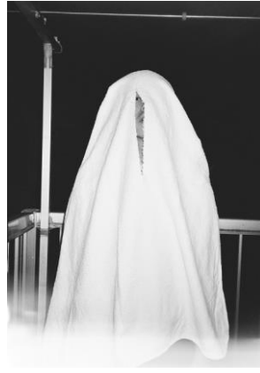
Torn blanket (about home) 2015