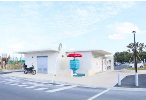
from the series "The Others" Okinawa 2016-2019