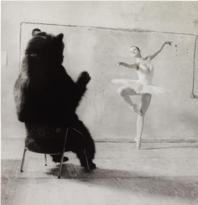
Taste for Russian Ballet from the series "Taste for Russian Ballet" 2008