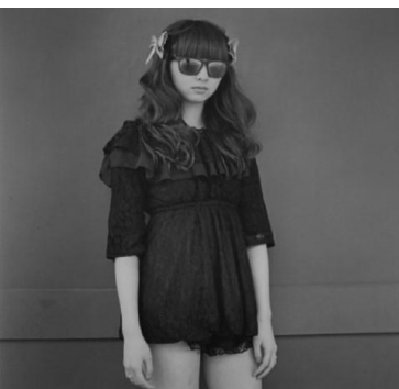
A girl who was like a dragonfly 2011